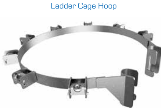
Ladder Cage Hoop