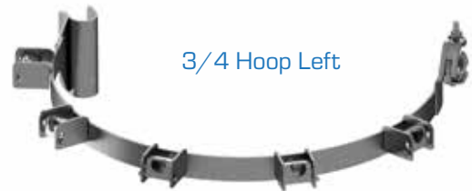
3/4 Hoop Left