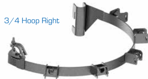
3/4 Hoop Right